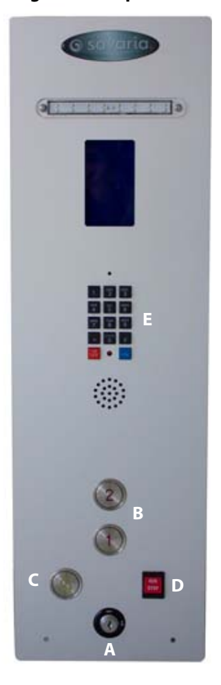
Figure 1: Sample COP

This button can be used at any time to stop the cab and activate the alarm buzzer.