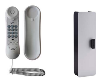
Figure 2: Standard Phone and Phone Box

If the unit has a standard phone, it is located in the cab phone box (see below).